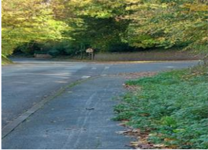
Location 1: Hillside Road