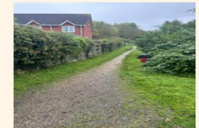
Foxley Entrance, Main Street