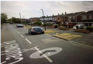
Location 2: Caldwell Road