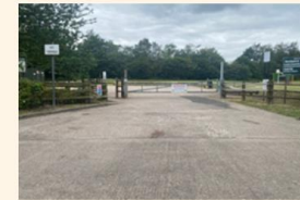
Badger's Hollow Recreation Ground, Coton Park