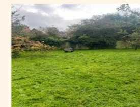
Linton Orchard, Colliery Lane