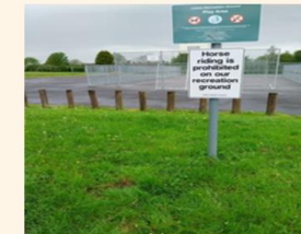
Linton Recreation Ground, Main Street