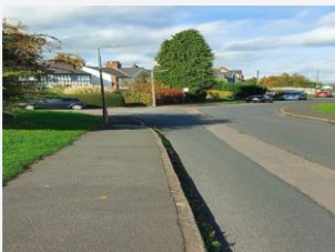
Location 3: Coton Park